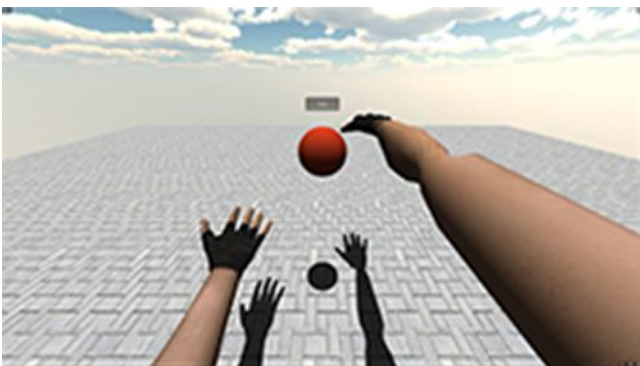
Figure 2: The first task: Balance Ball

The user was requested to move the arm, so it stays on a starting position. There, a ball was dropped after a short count down. The user was then required to balance the ball for as long as he can. A perfectly vertical shadow indicated where the ball would fall. This was used as an aid to the lack of good depth perception to the user, where the user is expected to use depth on his movements. This task was chosen to evaluate conditions where most concentration lies on controlling an object on a slow and predictable environment (the ball responds only to the gravity and the forces the user applies). We measured the time the user is able to balance the ball. The test is repeated for 10 iterations and then the Sample Rate is, randomly switched. On each switch, the user answers the questionnaire.