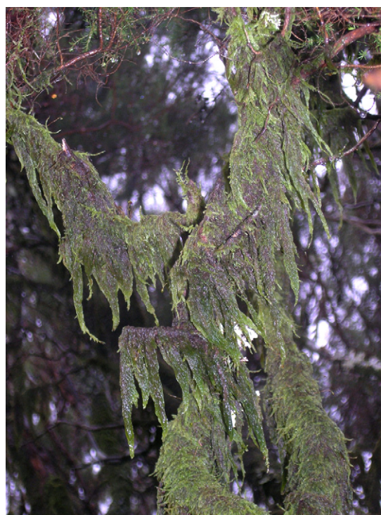
Fig. 1. Pendant epiphytic bryophytes on an E. arborea branch.

almost completely covered by epiphytes, especially mosses and, to a much lesser extent, lichens (Fig. 1). This coverage can be so thick, that some stems can double their diameter, also contributing to the capture of fog droplets (González, 2000). It is also known that due to physiological constraints in very wet forest, epiphytic bryophytes are much more frequent than lichens (Sillet and Antoine, 2004). Another observational proof of the high water content that drops under these trees is the marked division line (Fig. 2) between ground soil vegetation under the tree canopy and outside the forest. It is easy to see a very marked frontier between the mountain prairie land dominated by Agrostis castellana and Pteridium aquilinum and the soil community under the forest canopy that is dominated by bryophytes. This is due to differences in evapotranspiration, desiccation, radiation and water availability conditions between canopy's shaded and open areas.